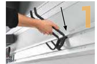
Insert bracket into top channel

Installing hooks and accessories on Gladiator® Wall Systems is as easy as 1,2,3.