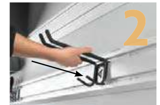
Secure bottom tab