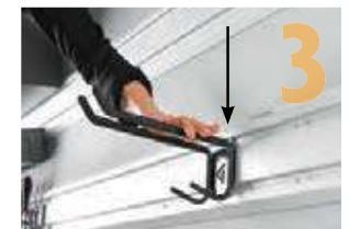
Push down to 'lock' in place

COMPLETE FLEXIBILITY: ALL ACCESSORIES EASILY REPOSITION ALONG GLADIATOR® WALL SYSTEMS TO ADAPT TO YOUR CHANGING NEEDS.